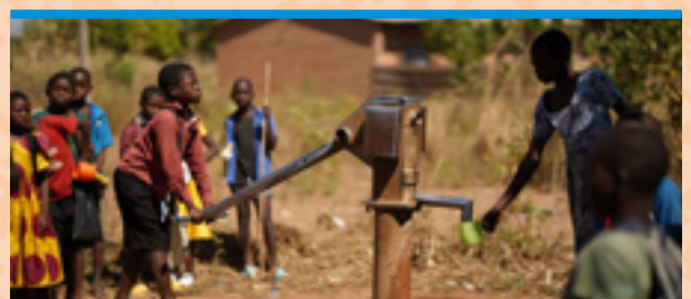
Patrick uses the water pump at Puteya Primary School.