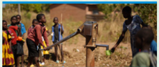
Patrick uses the water pump at Puteya Primary School.