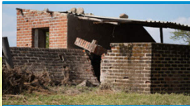
Destruction from Cyclone Freddy in Chinkhwangwa Village in the east of Malawi.

(Irish Bishops' Conference, Spring Statement 2023)