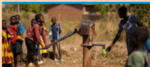
Patrick uses the water pump at Puteya Primary School.