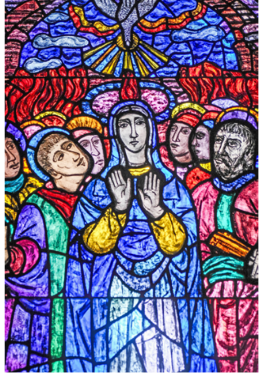
Pentecost Window by Evie Hone at Manresa Jesuit Centre of Spirituality, Dollymount.

Lord, as we meet together, and celebrate once again the memory of that first Pentecost, may it be for us as it was then a moment of empowerment, an awareness of your Glory in this dark world, a life changing experience.