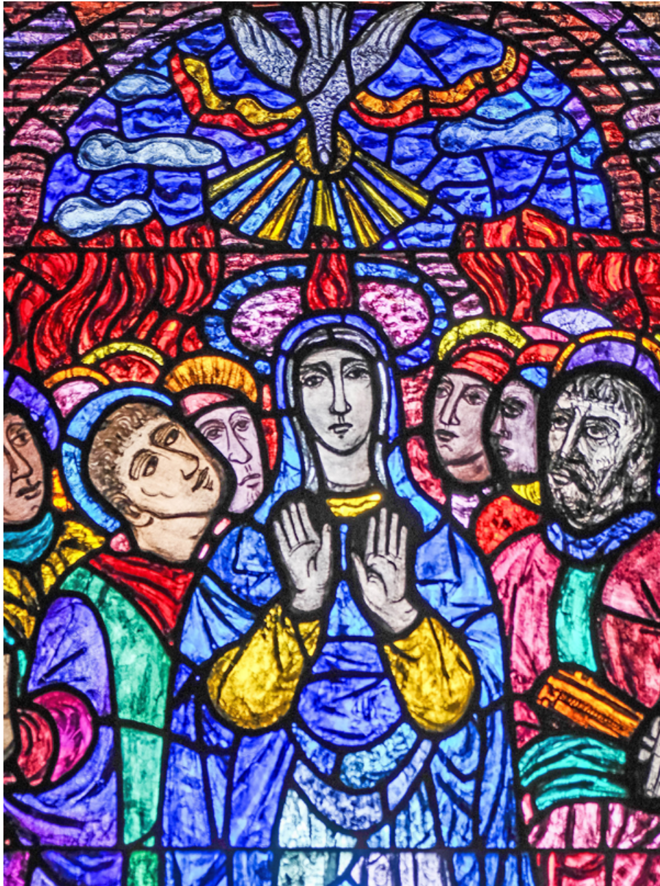
Pentecost window by Evie Hone at Manresa, Dollymount, Dublin