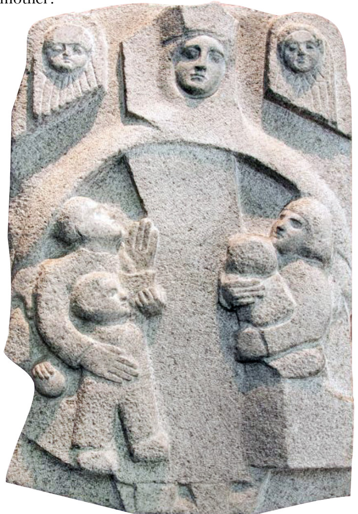
Carving of Our Lady, Mother of the Church, a gift from the Carmelite Community, Gort Mhuire, to the Church of the Ascension of the Lord, Balally.

We pray that the image may help us to see Mary as the first Christian, protecting us and leading us all to Christ. Amen