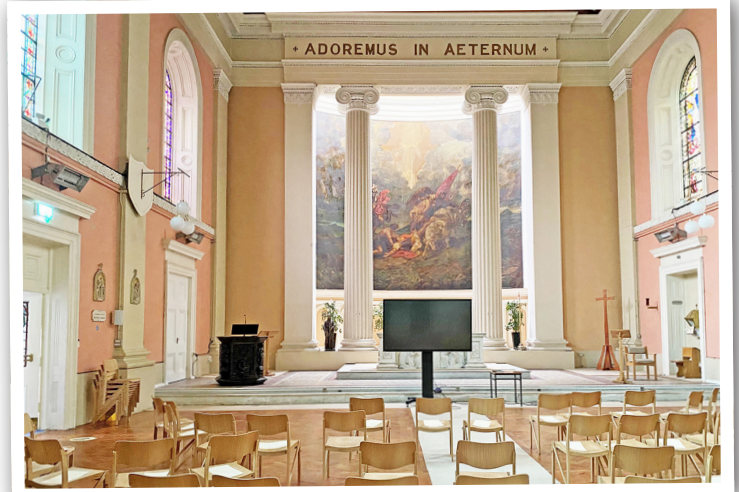
The newly renovated St Paul's Church, Arran Quay