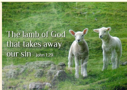
The lamb of God that takes away OUR SIN - John 1:29